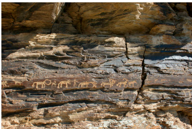
Figure 2. The petroglyphs of the Kyzyl-Chin.

TSU scholars have been doing regular research in the Aktru valley glaciers since 1952. For more than 50-year observation period summer air temperature has increased on average by 0.2\text{ }^{\circ}\text{C} per decade. And the process of warming has been accelerating since 1985 everywhere in the Altai Mountains. The researches show that the rate of retreat has increased in recent years. The published data [1] indicate that during the period from 1999 to 2008 annual retreat rate of the Maliy Aktru increased from 5.4 to 16.1 m per year. There are no precise data concerning the glacier's retreat for the last 2–3 years, but it can be seen that its square and volume of ice have decreased considerably.